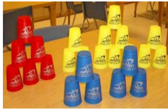
Figure 1. Display of different practice stacking sequences (Red Cups = 6 stack, Yellow Cups = 3-6-3 stack, Blue Cups = 3-3 stack).

•2 (group) x 3 (sequence) mixed ANOVA with alpha = .05 was used for stacking time statistical analysis.