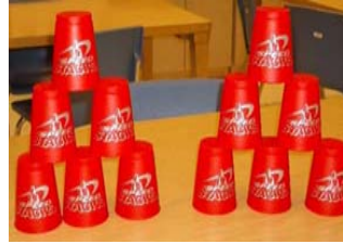
Figure 2. Display of 6-6 stacking sequence used as the transfer test.